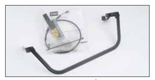
Operator Presence Bail Kit 105-5363