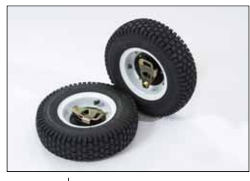
Wheel Kit | 04123