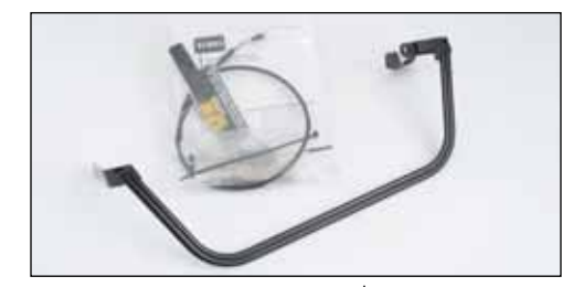
Operator Presence Bail Kit 112-9282

• Allows operator to mow in low light conditions