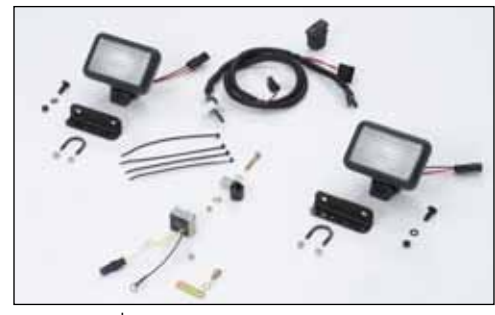
Light Kit 110-3463