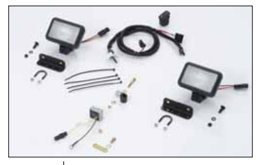
Light Kit | 04061

• Allows operator to mow in low light conditions