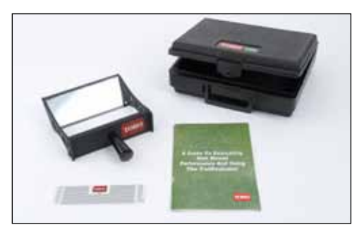
Turf Evaluator | 04399

• Mirror device used to assess the conditions of