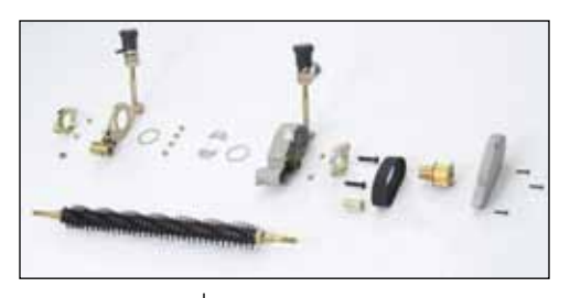
Groomer Reel 04132