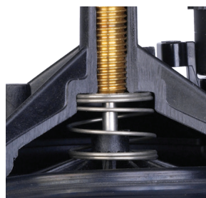
Self Cleaning Metering Pin A self-cleaning feature that operates two times during every valve cycle ensuring smooth positive opening and closing.

Provides superior performance and extended life without tearing in high-pressure golf applications.