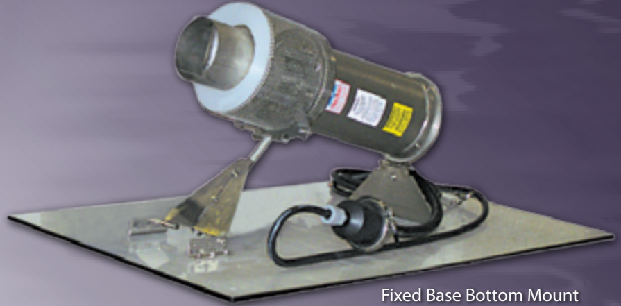
Fixed Base Bottom Mount