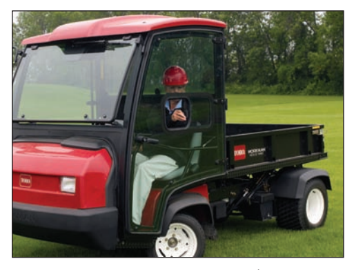
Cab – Sliding Window Door Kit | 07375