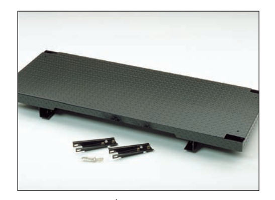
1/3 Area Flatbed 07341