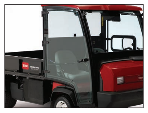
Cab – Solid Window Door Kit | 07376

An elevating, scissor-lift work platform with 600 lb (272 kg) lift capacity that can be raised from 38" to 98" (96cm – 250cm)