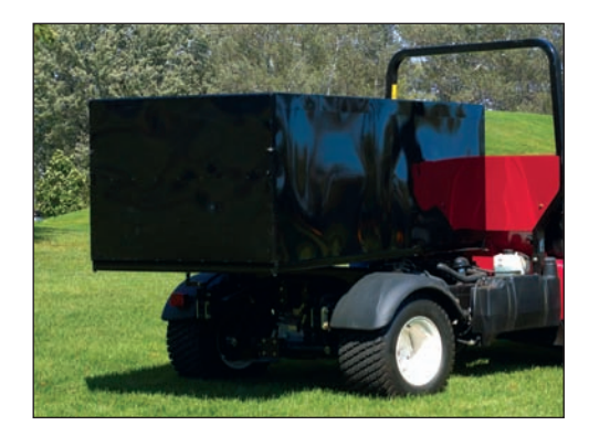
Casket Transporter | Allied