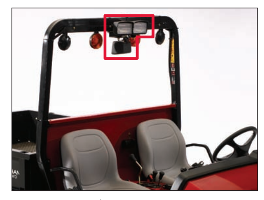
Work Light Kit | 117-4827

Consists of three work lights for mounting on top of ROPS bar