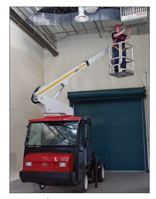
Patriot Lift | Allied